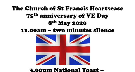
"To those who gave so much, we thank you"

The weather held and the planned outdoor offerings were laid on without a hitch. The celebrations and commorations were of course nothing like what they might have been – but the day, nevertheless, felt special and the hope is that everyone was able to join in one way or another.