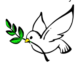
May God give peace. God give peace.

What does the Lord require of you but to do justice and to love kindness, and to walk humbly with your God.